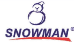
SNOWMAN LOGISTICS LIMITED.